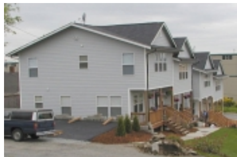
Four Plex at Marine View Drive